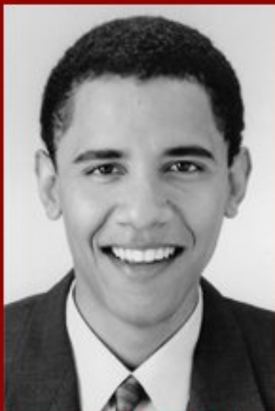
Senator, 13th District BARACK OBAMA, D - Chicago

Springfield: 105b Capitol Bldg., 62706; (217) 782-5338; Fax (217) 782-5340